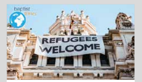
'We retain deep misgivings about the safety of the Rwanda Bill' - Churches have reiterated their opposition to the Bill