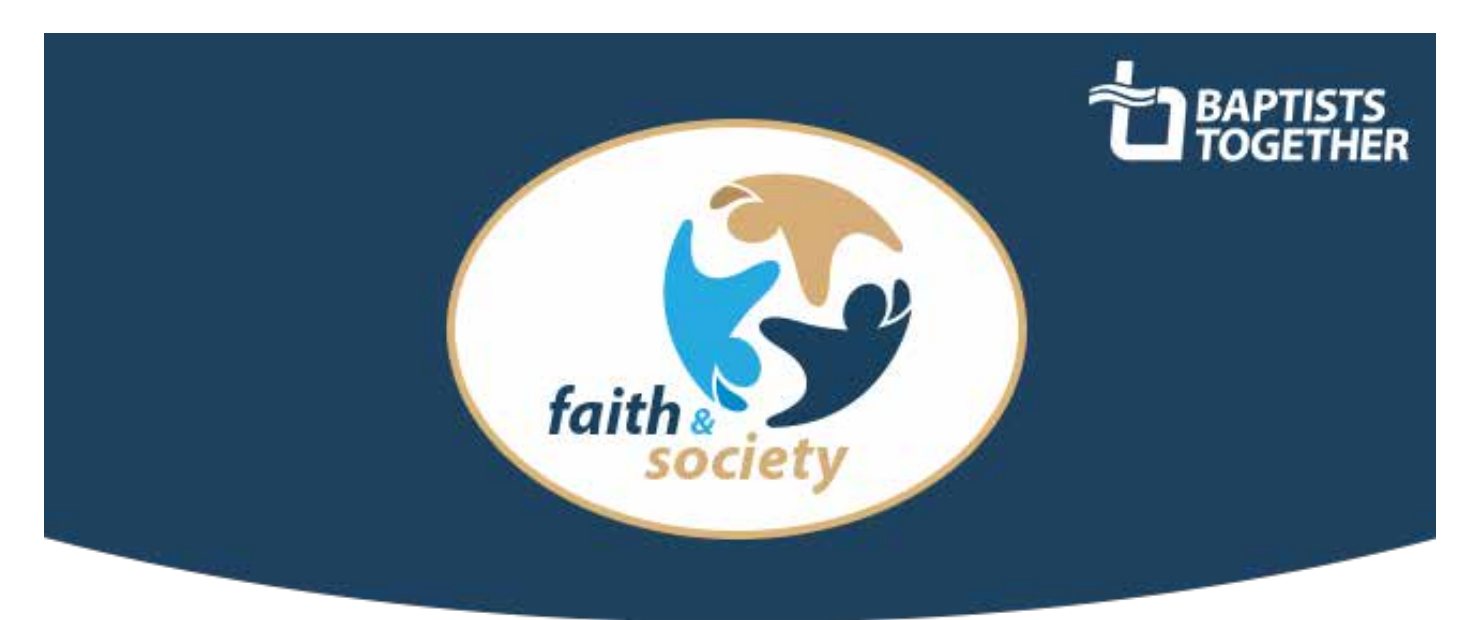
Update: May 2024