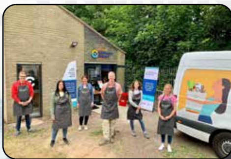
From left to right: Emmanuel Baptist Church in Liverpool Moortown Baptist Church.

Baptists believe that each Christian has a duty to share their faith with others. Along with this emphasis on evangelism, Baptists recognise that mission includes all of us as ambassadors of Christ wherever God has placed us, and involves social action – promoting justice, social welfare, healing, education and peace in the world.