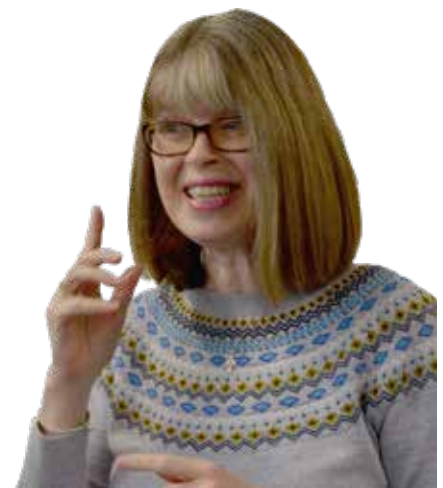
Lynn Green is the General Secretary of the Baptist Union