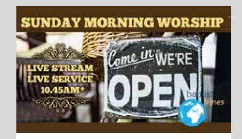
Live stream, live service - how a small church is attempting to bring everyone along as it emerges from the pandemic