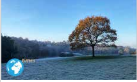
COP26 - what can Christians and churches do? We could make a game-changing contribution by acting together