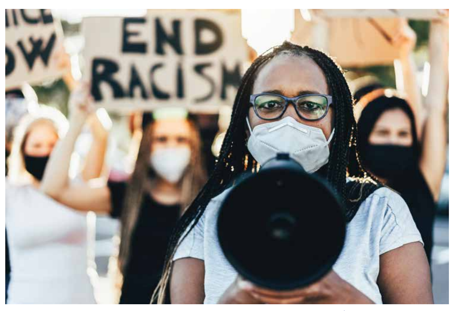
Wonderful Youth: Peace