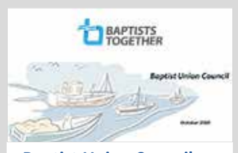
Baptist Union Council - a report of the first online meetings in October